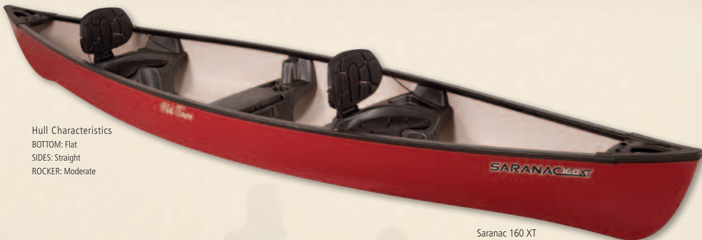
Saranac 160 XT model shown